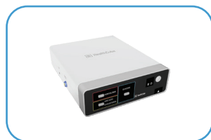
Multi Vital Device